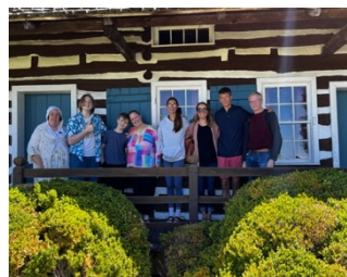
Confirmation classes are regular visitors to the Strawbridge Shrine.